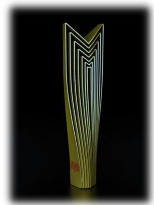
The trophy created by © Quentin Vaultot

The Festival-goers' favorite among the new series presented in International Competition, French Competition, International Panorama, Made in USA and Midnight Comedies.