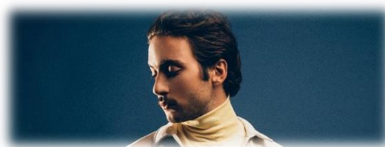
ALEX VIZOREK – MC for Closing Ceremony