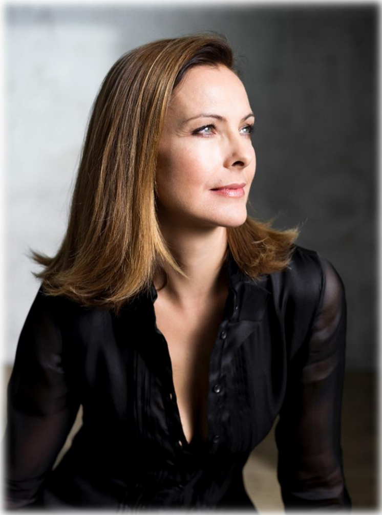
CAROLE BOUQUET Actress France